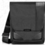
VENUE XL 13"