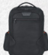
STUDIO ECO* 15"