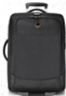
WHEELED 420 18.4"