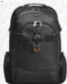
BUSINESS 120 18.4"