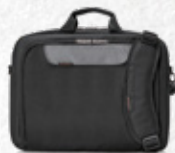
ADVANCE ECO 14.1"/16"