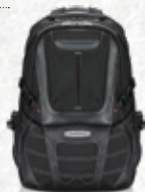
CONCEPT 2 17.3"