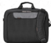
ADVANCE 18.4"/17.3" 16"/14.1"/11.6"