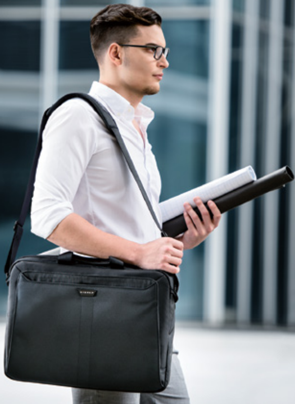
LUNAR Laptop Bag - Briefcase