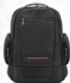
BEACON 2 18"